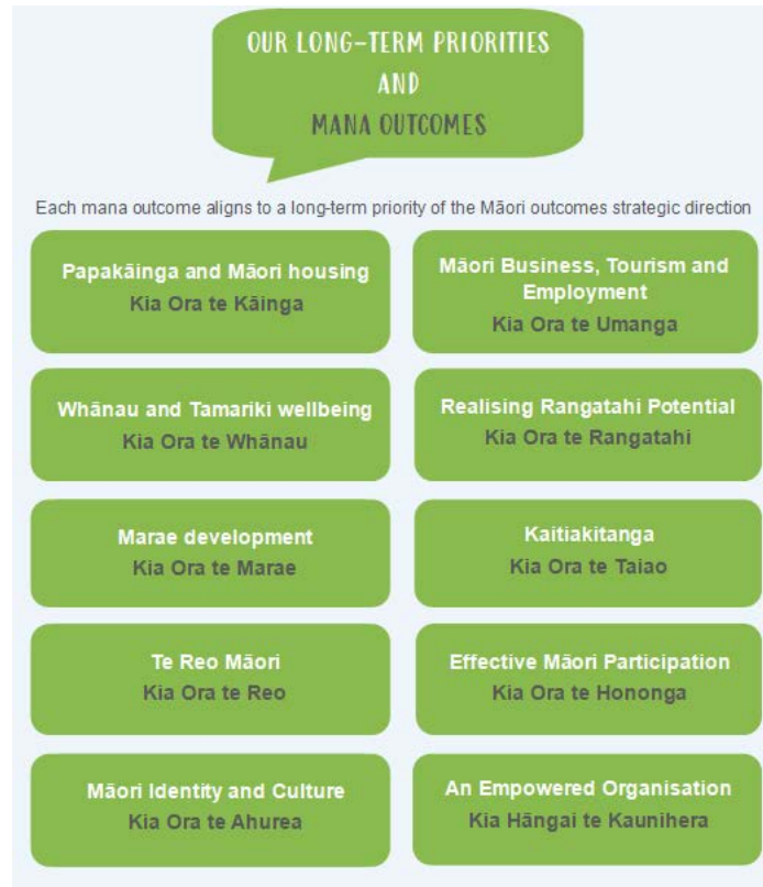
Figure 1: Māori Outcomes Framework – Kia Ora Tāmaki Makaurau

12. This outcomes-based approach shifts the council's focus from internal responsiveness to the delivery of priorities to benefit Māori. However, a focus on responsiveness will continue through the development of Māori Responsiveness Plans in each of the council's directorates and CCOs, under the leadership and support of their Māori Outcome Leads.