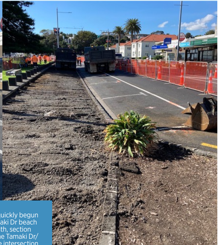
Work has quickly begun on the Tamaki Dr beach side footpath, section between the Tamaki Dr/Selwyn Ave intersection and the clock tower