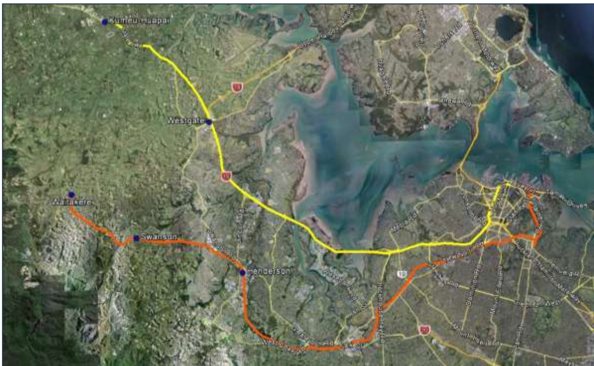
Figure 1: General study area of Kumeu/Huapai, Waitakere and Swanson plus onwards links to the city

Figure 1 defines the general study area, with SH16 highlighted in yellow and the existing rail service from Waitakere to Britomart in brown.